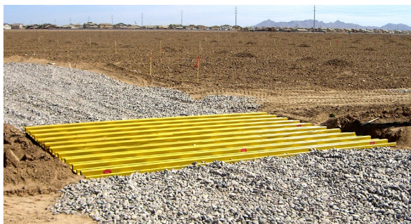
The Grate Device as shown above is 20' wide x 16' long