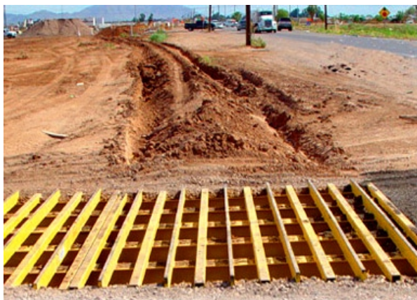
The Grate Device as shown above is 10' wide x 16' long